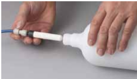
Model DWB-C Point of Use Water Purification Filter

Assure your patients of biofilm-free water lines without chemical use or the hassle of daily chemical tablets. Model DWB-C can be used in conjunction with the Clean+Clear DW4616-C whole-office system or DS1045-C under-sink water purification system to reduce many harmful contaminants.